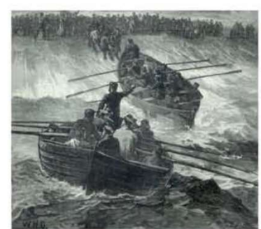
Lerrets saving lives from the 'Avalanche'