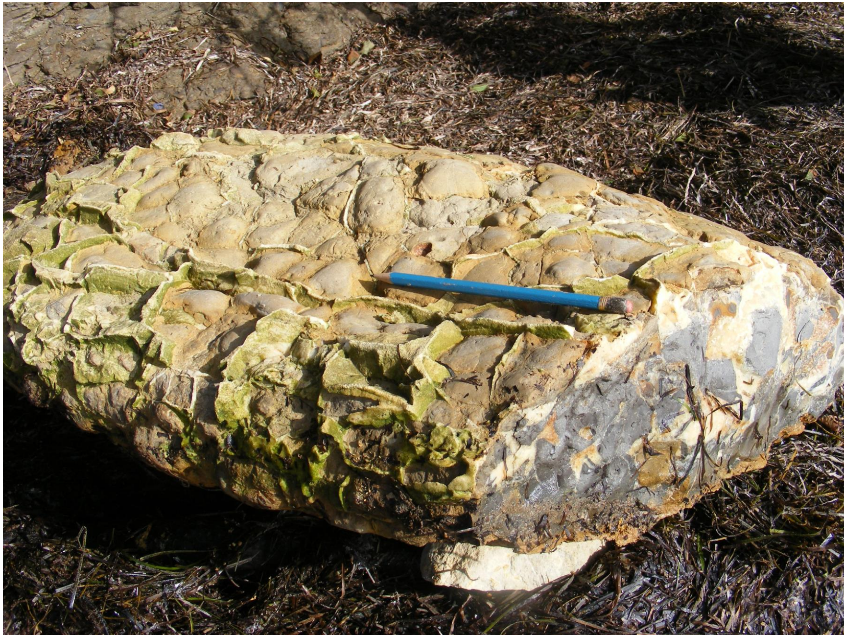
Septarian nodule Also known as turtle stone or Melbury marble