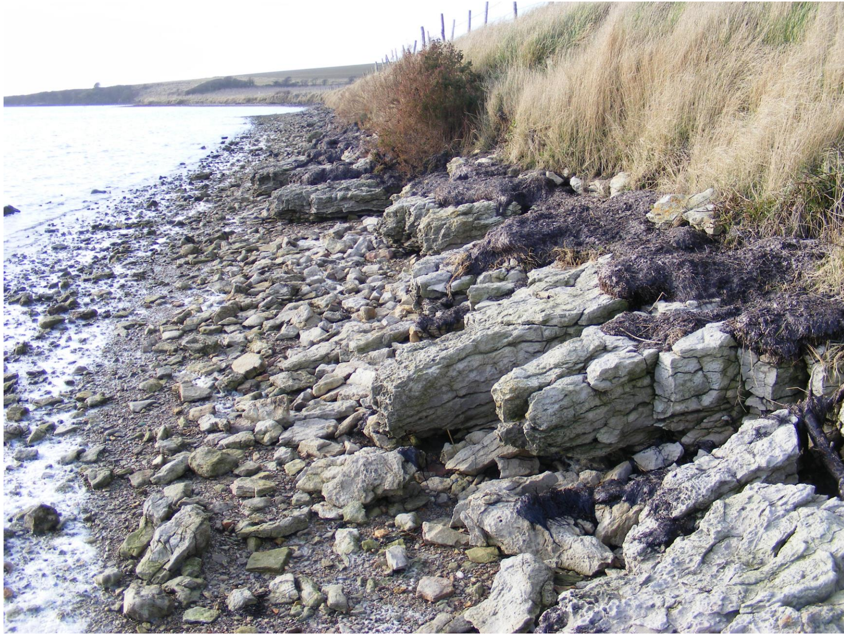
Cornbrash At Butterstreet Cove