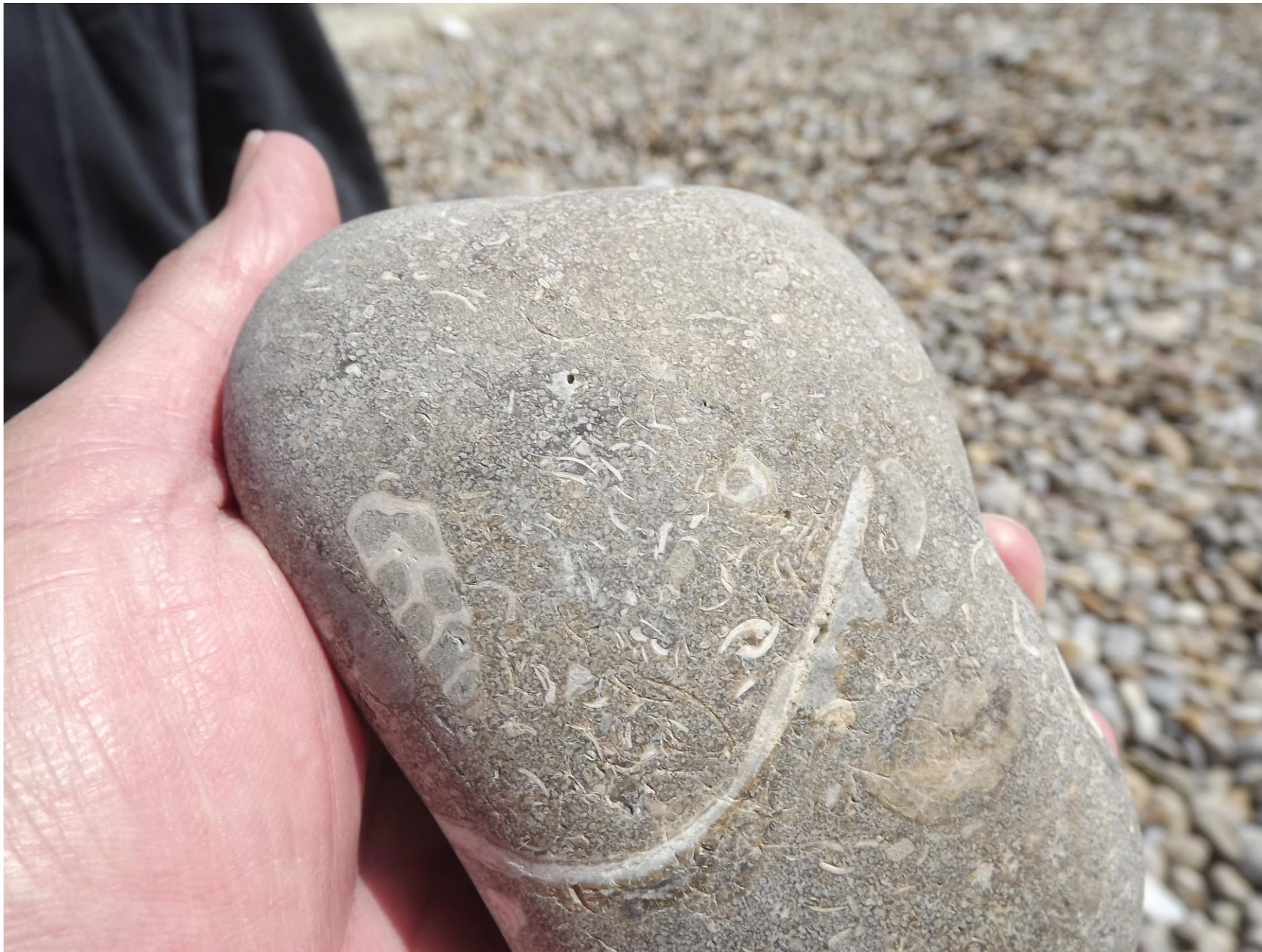
Portland limestone chert beach pebble with fossils and oolitic feature From Chesil Cove