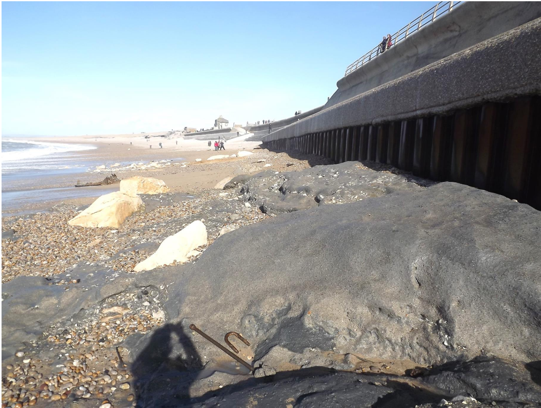
Kimmeridge clay exposed in Chesil Cove