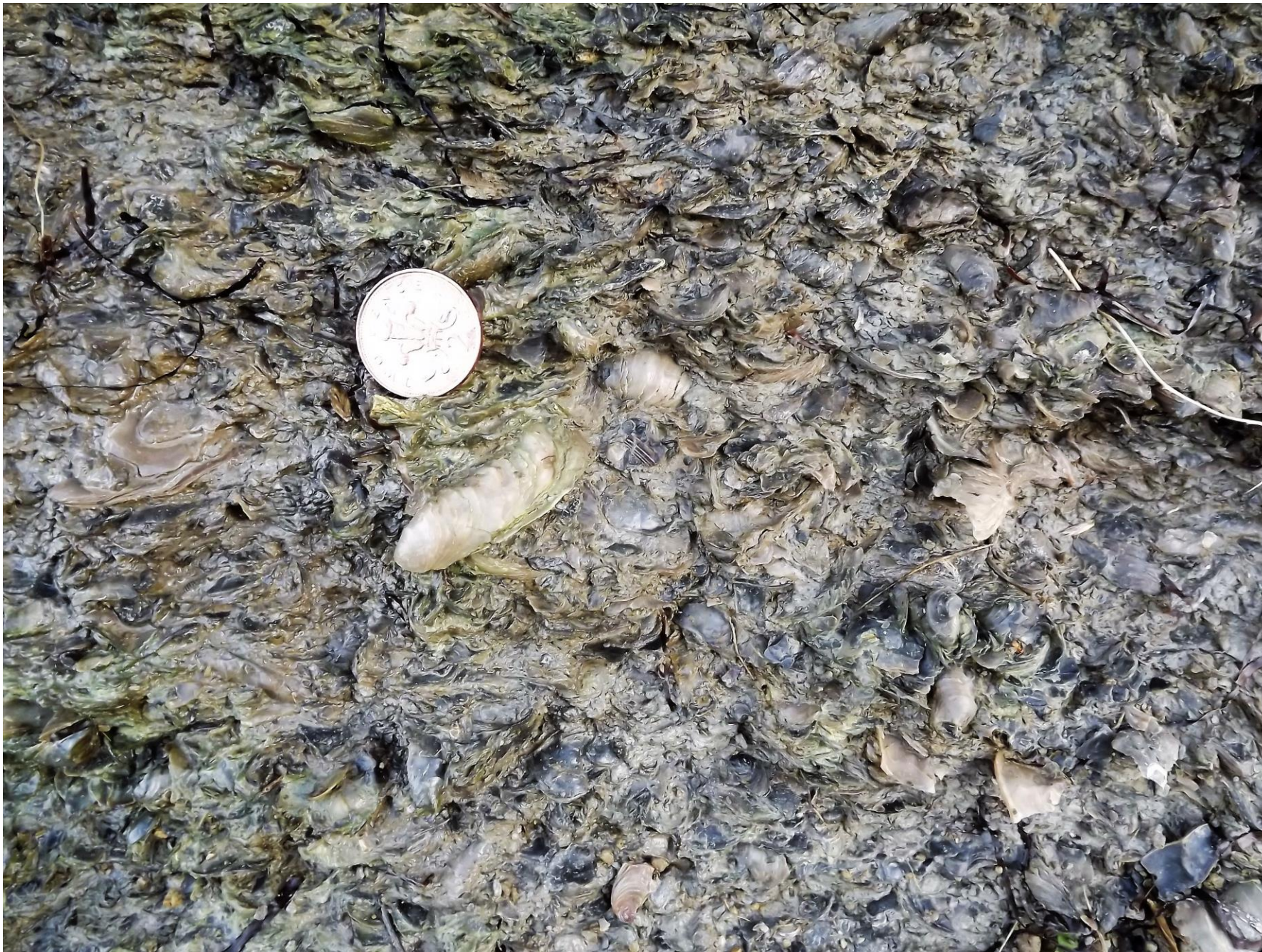
Close up of oysterbed with Ostrea hebridica