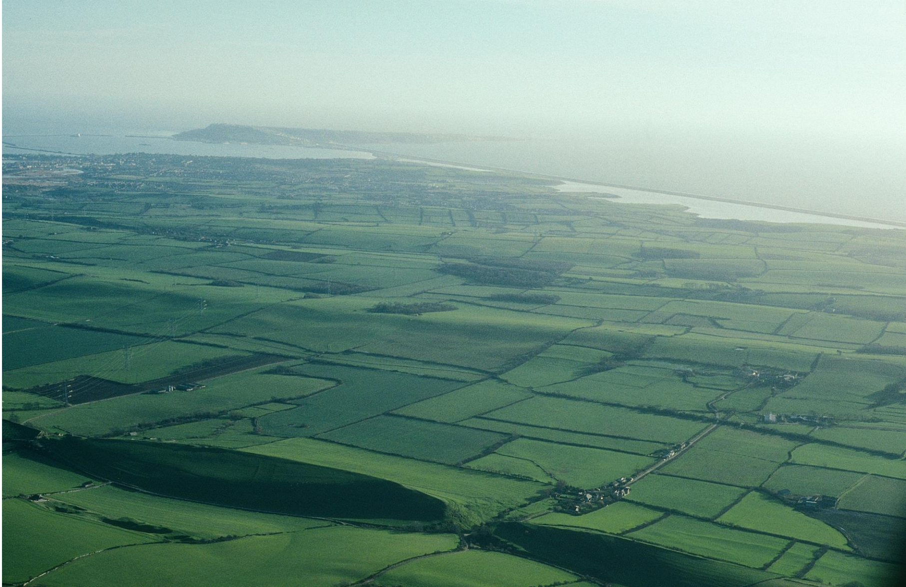
View across the Weymouth anticline