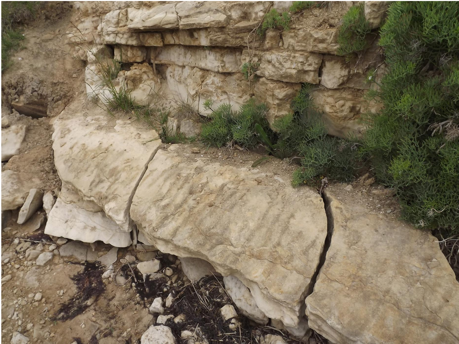
Corallian limestone near Camp Road with cross bedding and ripple marks