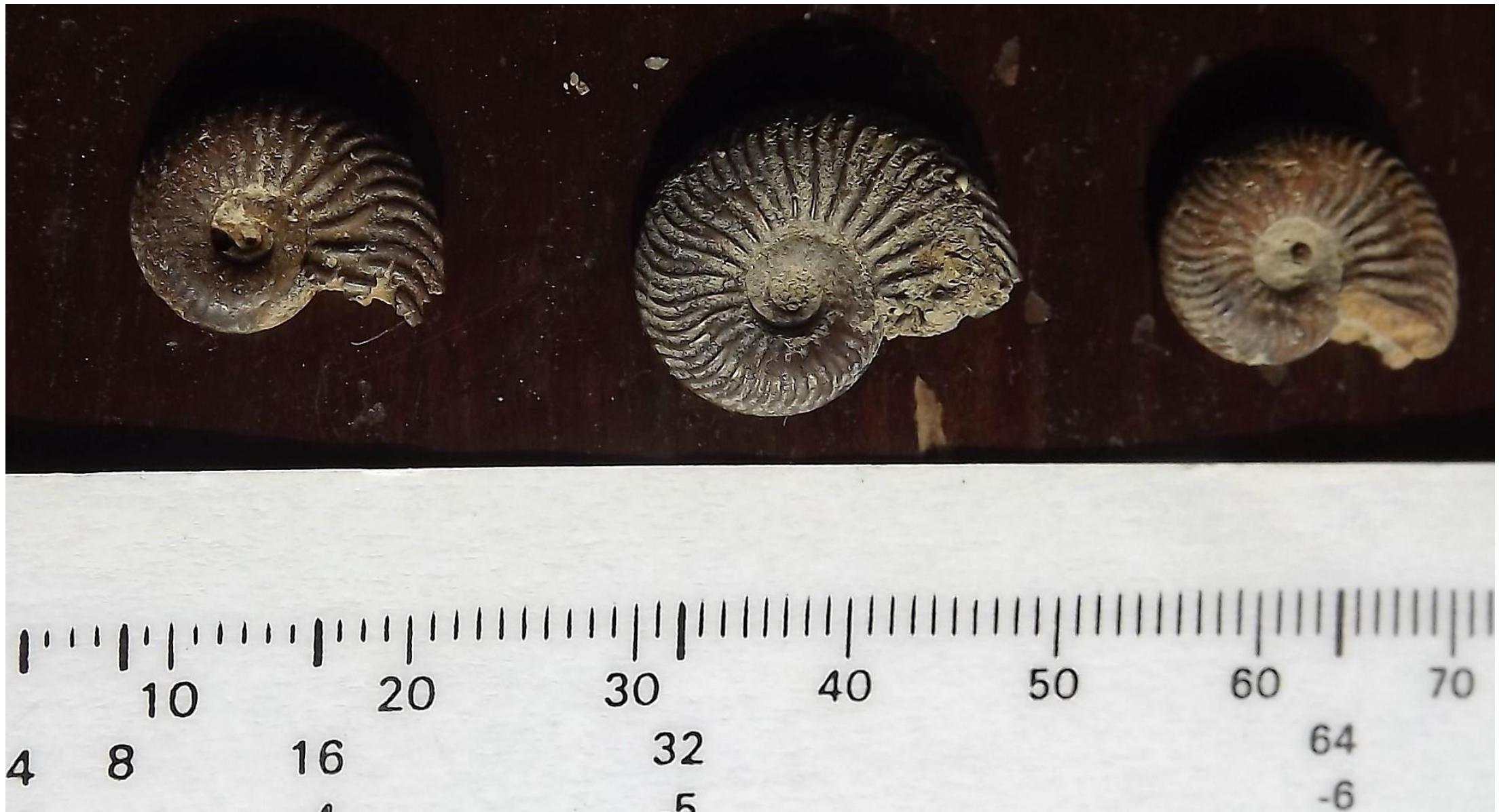
Ammonites from Tidmoor Cove