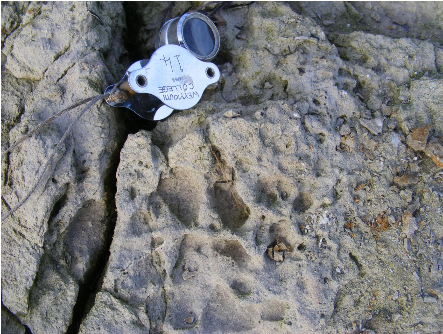
Honeycomb weathering at Butterstreet Cove