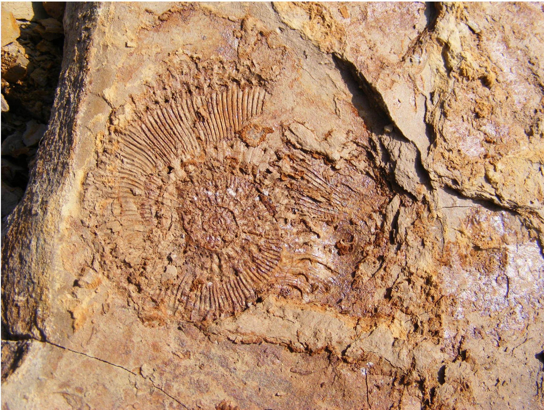
Ammonite Kosmoceras from the Oxford clay north of Tidmoor Point