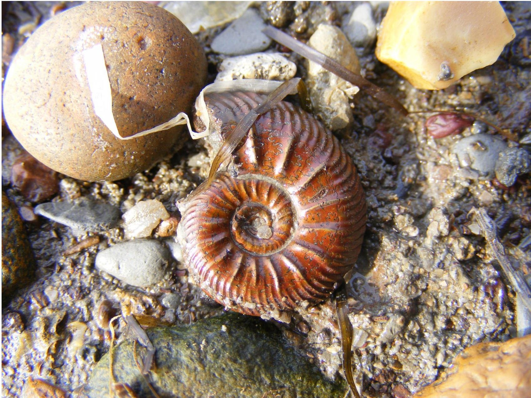
Ammonite On the beach at Tidmoor Point