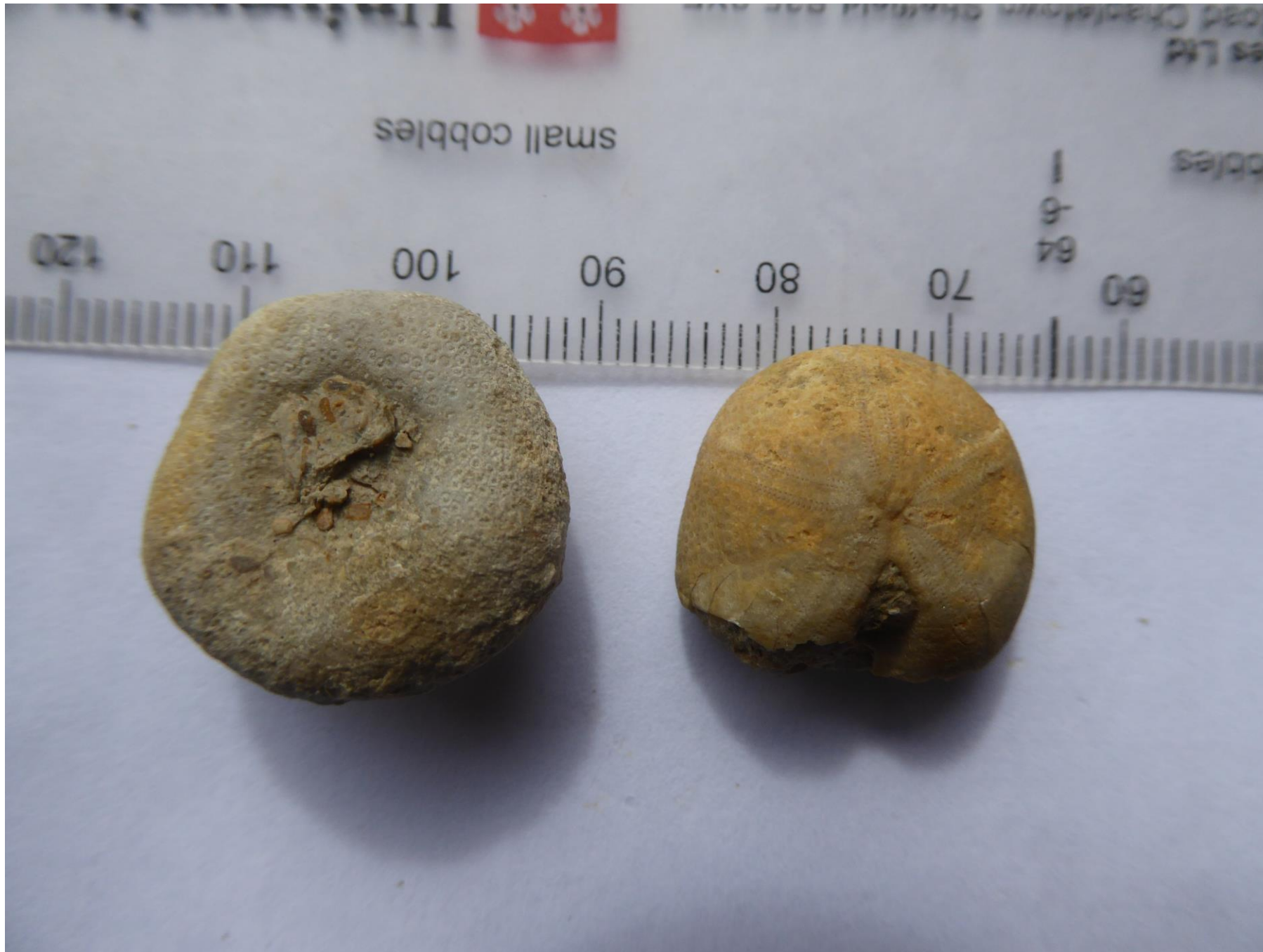
The echinoid Nuceolites Scutatus from the corallian near Camp Road