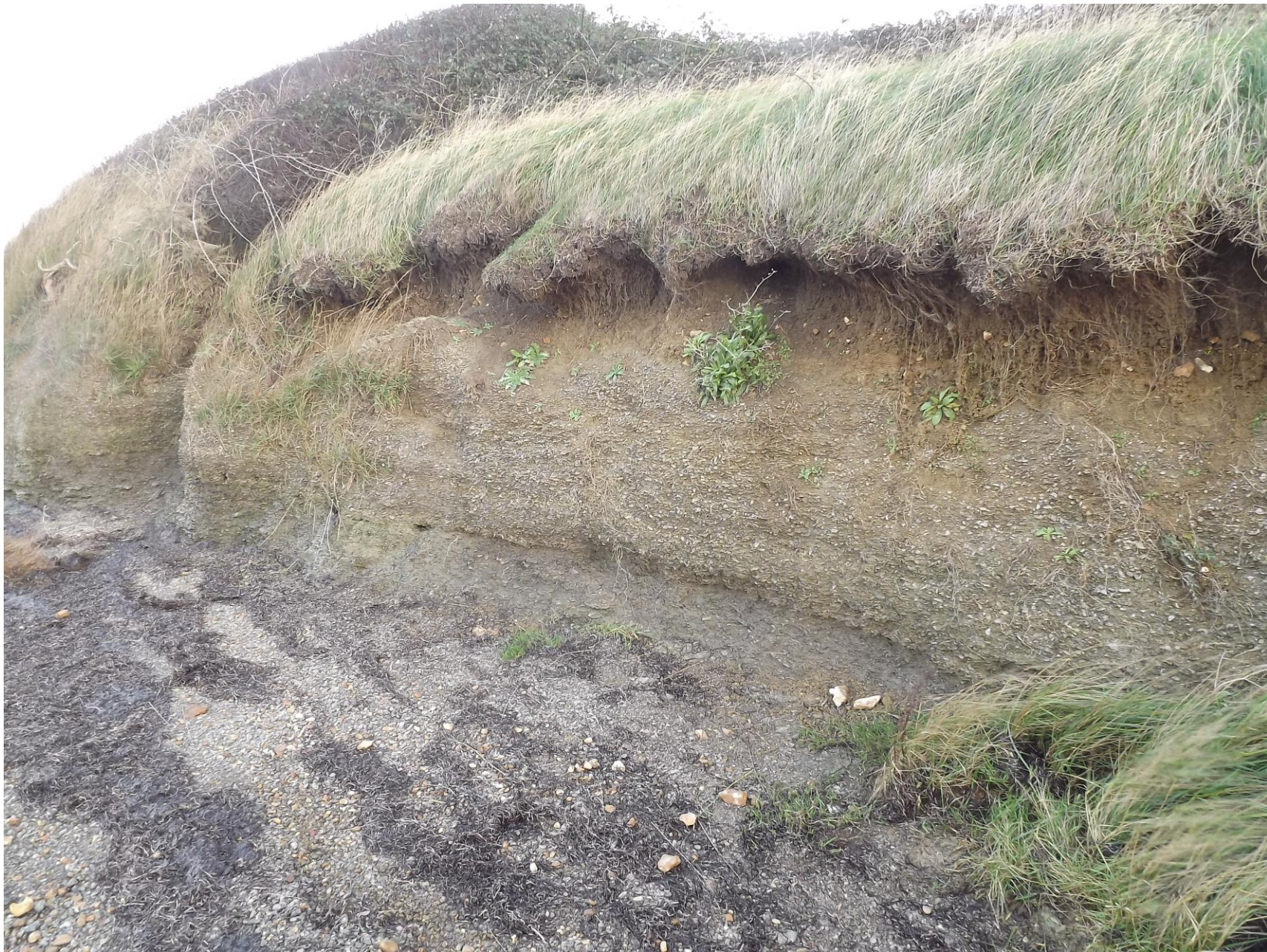
Oyster bed (lumachelle) Ostrea hebridica at Langton Hive Point