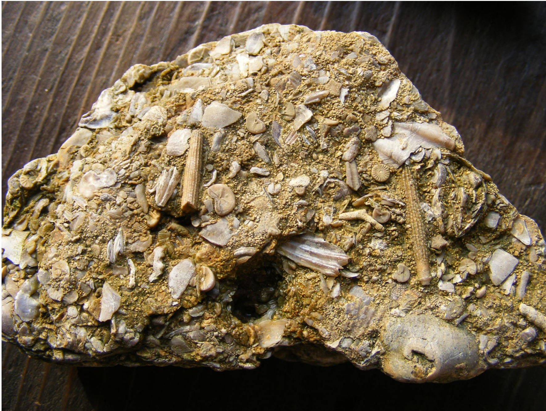
Forest marble Example from Moonfleet Beach