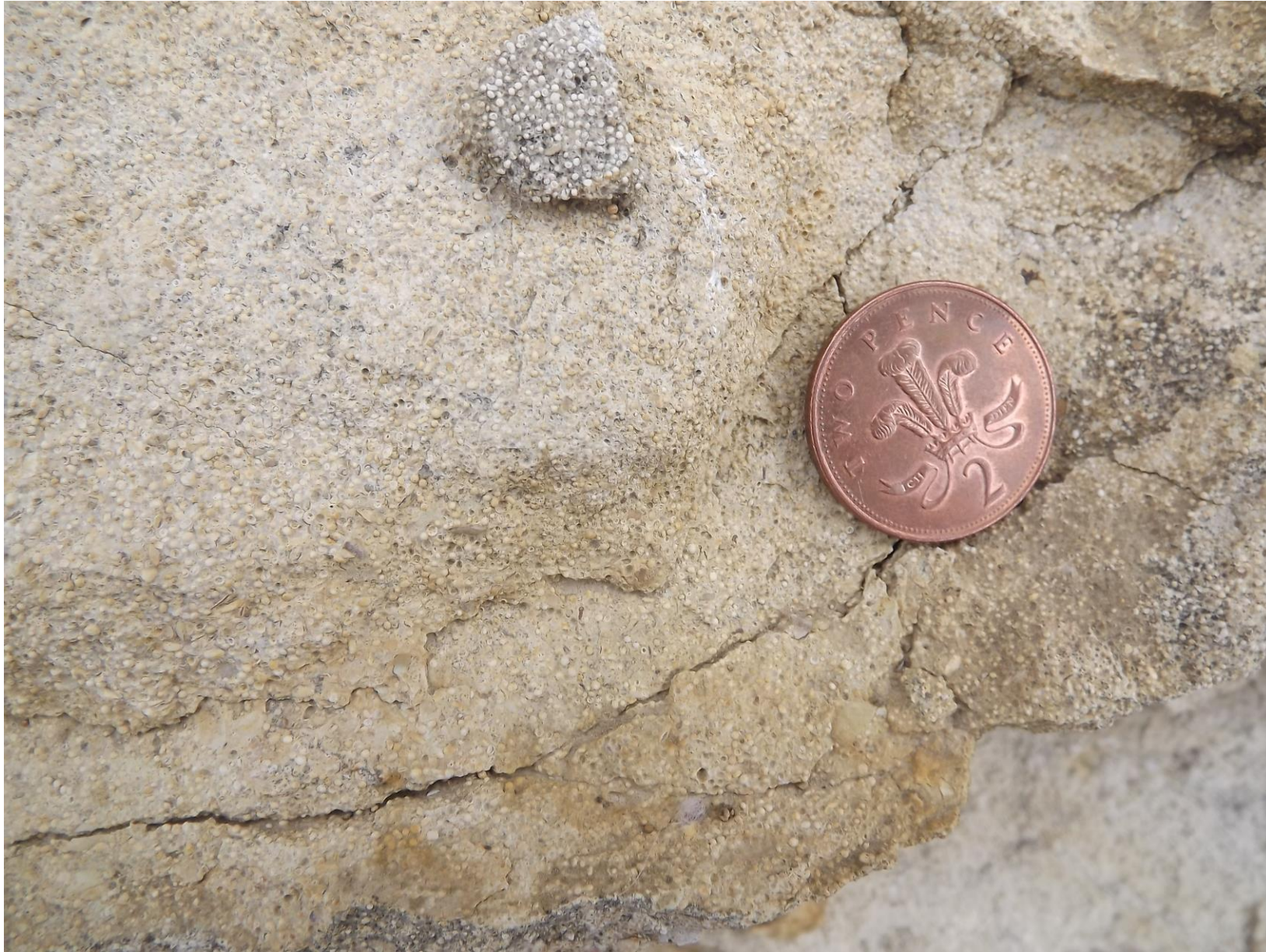
Osmington Oolite Limestone