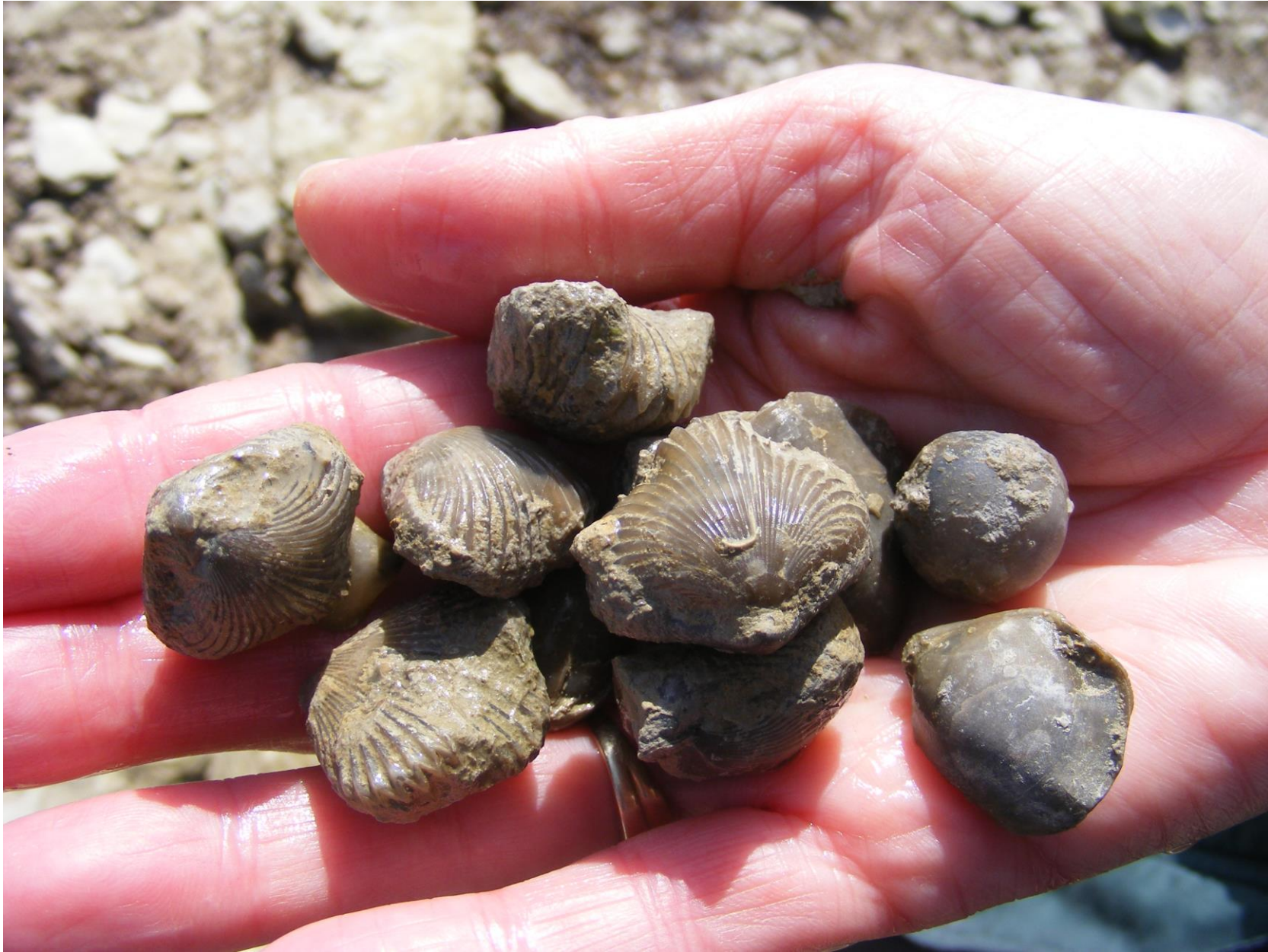
Brachiopods Rhynchonella boueti from Herbury